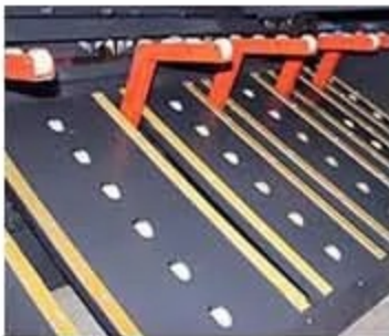
Pneumatic Back Supporter