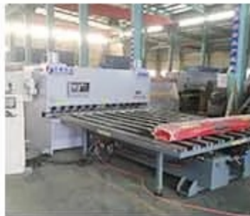
Front feeding Table