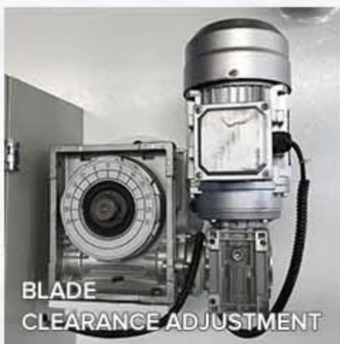
BLADE CLEARANCE ADJUSTMENT